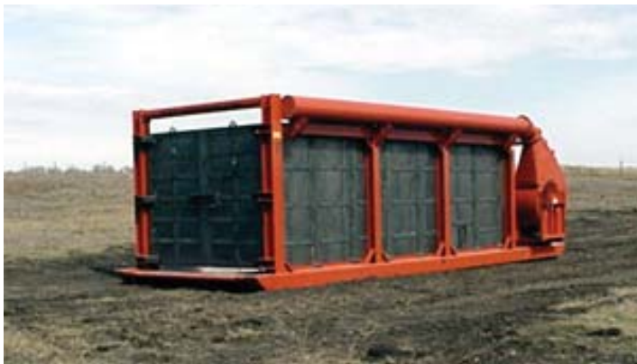
Air curtain incinerator

Contact information is available in Appendix A.