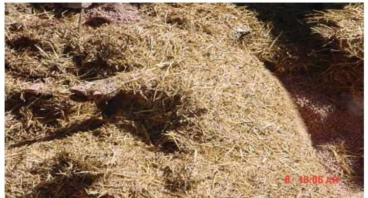
Insufficient cover material

Although composting is commonly associated with small animals like poultry, large animals such as cattle will compost under proper conditions. Control the composting process carefully to promote proper decomposition. Burying a carcass in a pile of straw to rot is not considered composting.