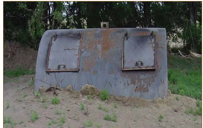
Bural pit cover

Winter burial is a challenge. However, burial pits may be prepared in the fall and a final cover placed in the spring. Estimate the winter death loss (Appendix F) and allow 0.75 cubic metres (1 cu. yd.) of burial pit volume per 450 kg or 1,000 lb. of carcass. A lid will protect mortalities from scavengers and prevent snow from filling the pit. The location must be accessible by equipment during winter conditions.